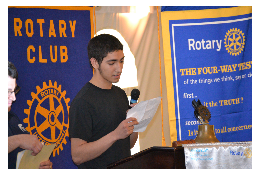
2018 District Conference Rotacon April 26-29, 2018 Join us in Sandestin