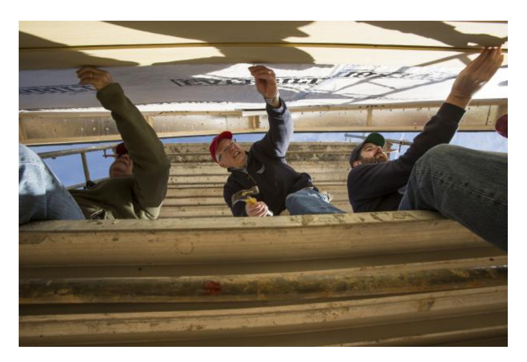
Habitat for Humanity, one of Rotary's newest service partners, builds homes for