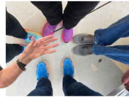
The Service Project Magician