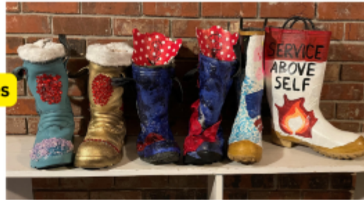
Boots for Heroes

Welcome Welcome Welcome to all who come to the Roswell Rotary meeting this Thursday for lunch. We will not only be hosting 13 of our 16 Interact Clubs but also the City of Roswell Youth Ambassadors for the Youth Day Parade on Saturday, Oct 3rd. This meeting is always inspiring and gives us the very face of hope on our stage.